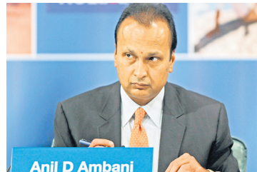
Anil D Ambani